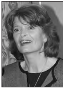
SEN. LISA MURKOWSKI

"If this action is allowed to stand, where will the next 'unique' circumstance arise," queried Alaska's senior senator. "EPA's actions here could have potentially widespread consequences for any development project, including airports and